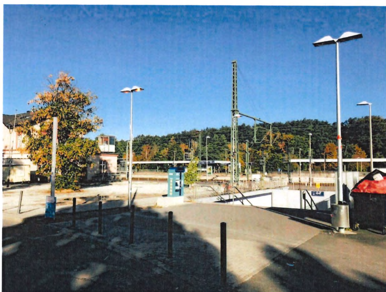
Train Station "Frankfurt am Main Stadion"