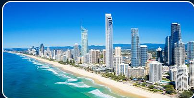
GOLD COAST T100 / 21-22 MARCH