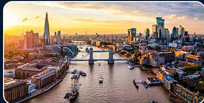
LONDON T100 / 25-26 JULY