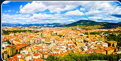
SPAIN T100 / 23 MAY