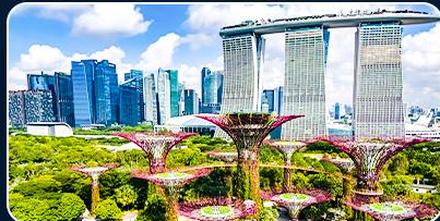
SINGAPORE T100 / 25-26 APRIL