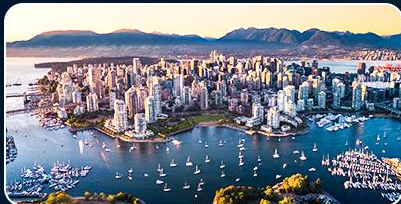
VANCOUVER T100 / 15-16 AUGUST