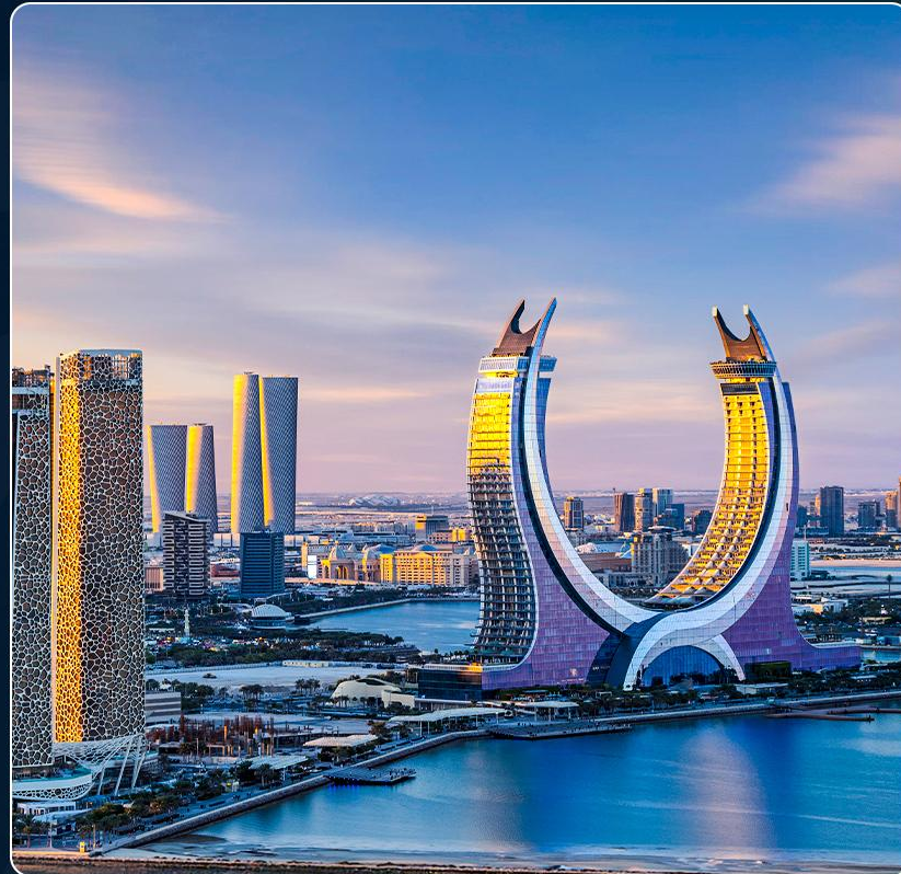
QATAR T100 / 11-12 DECEMBER / QUALIFICATION FOR 2027