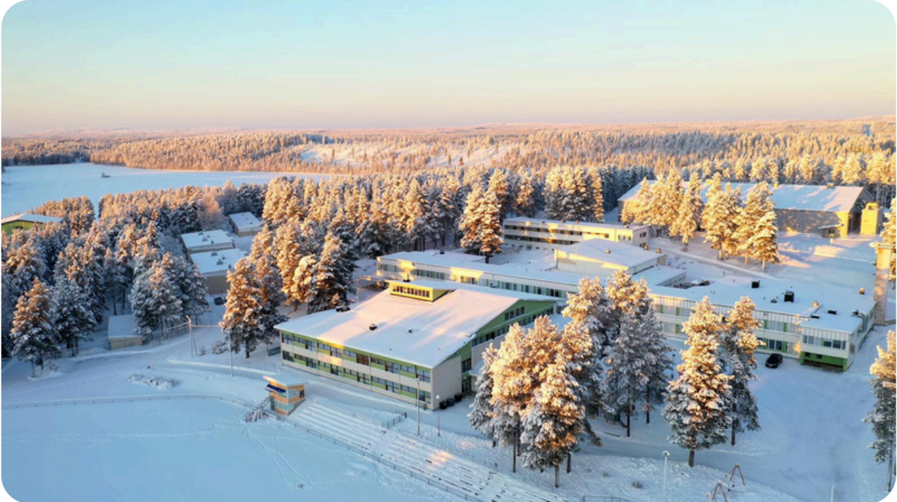
Competition venue and Kotivaara

Event center & Competition center address: Koulutie 2 D, 97900 Posio