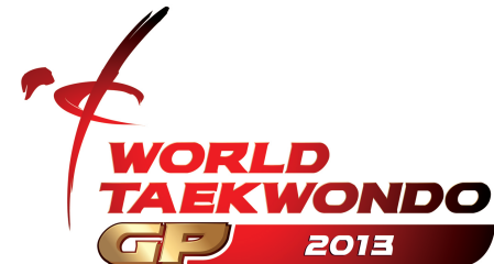
ILLUSTRATION WORLD TAEKWONDO GP™ FINAL