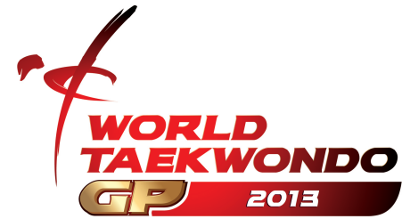
ILLUSTRATION OLYMPIC QUALIFICATION PROCEDURE