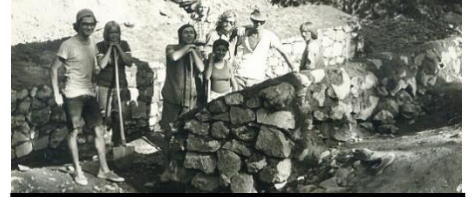
1974 Karasukabaklar – Gönen