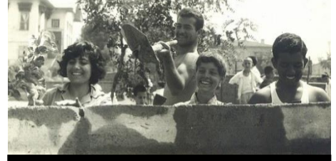
1961 Yakacık - İstanbul