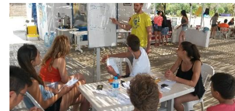
2022 Seferihisar – İzmir

Gençtur-Gençlik Turizmi Derneği'nin adı 19 Ocak 2019 tarihli Olağanüstü Genel Kurul toplantısında alınan karar