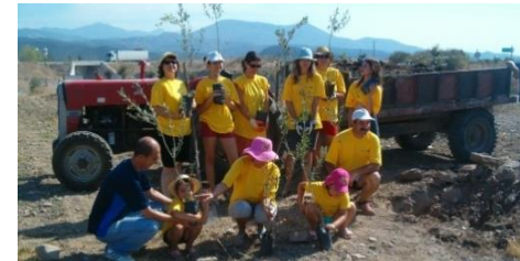
2007 Zeytinli – Akçay Family