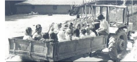
1993 Ortaköy - Çorum