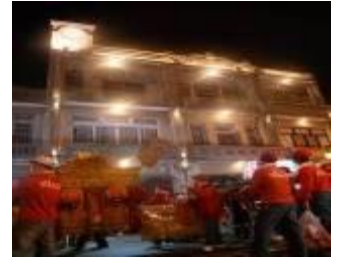
Xiluo Old Street