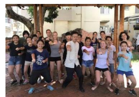
experiencing traditional Taiwanese kung fu