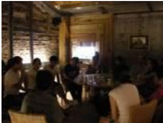
Great night In the Historic house