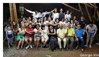
Having fun in Xiluo