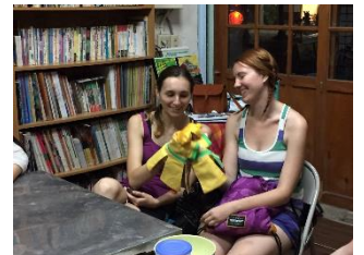
Playing hand puppet