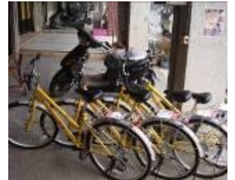
Your transportation- bike