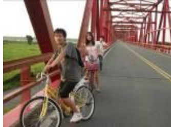
Riding on the Xiluo Bridge