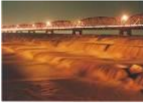
Night view of the Xiluo Bridge

history, and art while contributing to the local community.