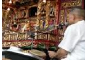
The traditional Puppet show & musical