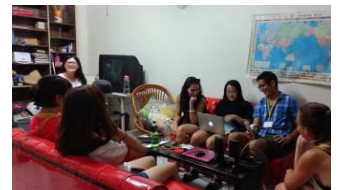
living room in the accommodation