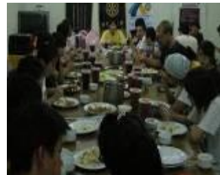
Volunteers eating together