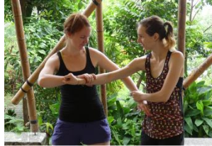
Chinese Kung Fu