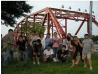
Volunteers at Xiluo bridge