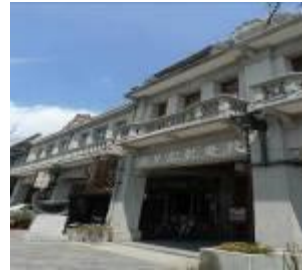
LXiluo Culture Museum