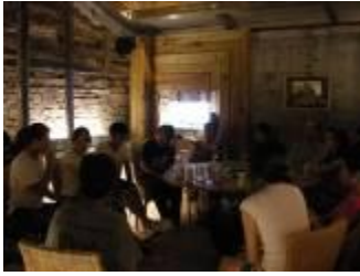
Great night In the Historic house