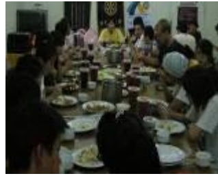
Volunteers eating together