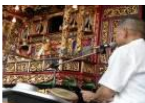
The traditional Puppet show & musical