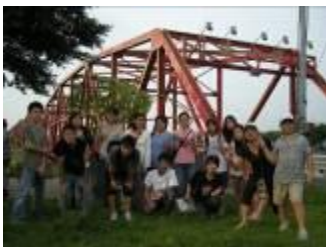
Volunteers at Xiluo bridge