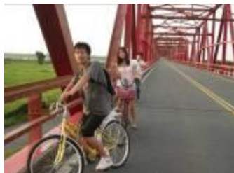
Riding on the Xiluo Bridge