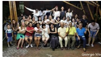
Having fun in Xiluo