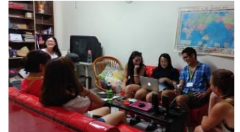
living room in the accommodation