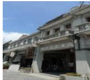
LXiluo Culture Museum