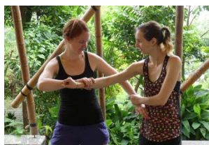
Chinese Kung Fu