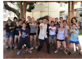
experiencing traditional Taiwanese kung fu