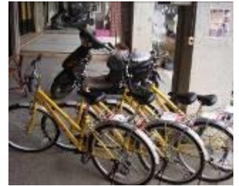
Your transportation- bike