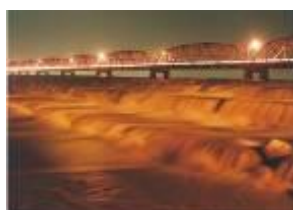
Night view of the Xiluo Bridge

Xiluo, located in the middle of Taiwan the northeast Township of Yunlin County, is situated in the Zhuoshui River alluvial fan valley which decrease progressively from the east to the south. The great Xiluo Bridge is one of the most famous landmarks in Taiwan and has been standing on the River for 68 years. You can not only admire the beautiful sunset, but also enjoy the historical atmosphere and the typical Taiwanese culture in Xiluo old street.