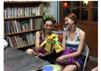
Playing hand puppet