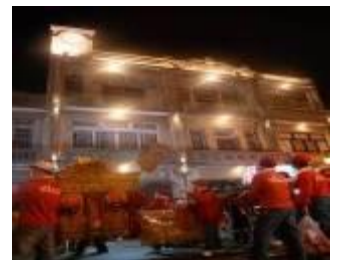
Xiluo Old Street