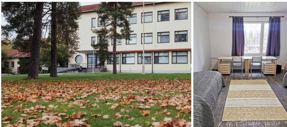
Location of Loimaa on the map, and LEKO accommodation 23.-26.7.

For the first part of the youth exchange (23.-26.7.) the participants will stay in Loimaa in LEKO folk high school. LEKO has a history as an education provider for more than 85 years. It is located in Hirvikoski, a village in a calm and beautiful rural area of Southwest Finland, a part of Loimaa town, 150 km from Helsinki, and 60 km from the city of Turku. The first few days will be spent getting to know each other and the area, focusing on intercultural activities, sustainable development and recycling. Participants will get to enjoy Loimaa with bicycles, and visit local eco-friendly places of interest. During the full youth exchange, the EYE mega game will encourage non-formal learning and intercultural exchange. The participants will be accommodated in double rooms with bedsheets provided. The participants will need to bring their own towels. During the youth exchange the food will be mainly vegetarian, taking into consideration possible dietary restrictions.