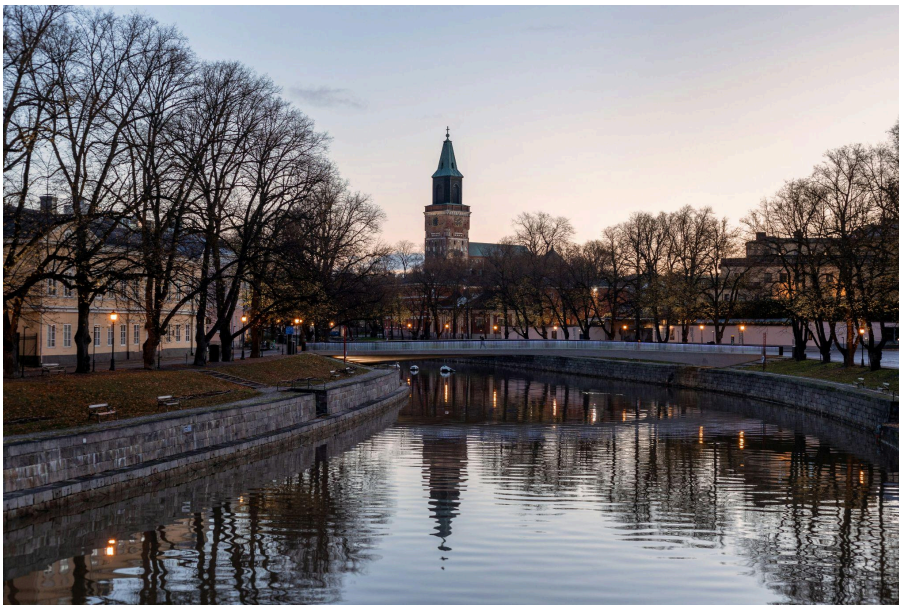
Turku city 29.-30.7.

On the morning of July 29th, the participants will be transported to the city of Turku , the biggest city in Southwest Finland with a population of about 200 000. After the peaceful countrylife there will be a chance to enjoy the city. The participants have the opportunity to familiarize themselves with the biological museum at the University, the library of Turku and some theme related places of interest. For the last night (29.-30.7.), participants will be accommodated in Turku Hostel Linnasmäki . From Turku, it's also convenient to travel back home, since there are ferries to e.g. Stockholm departing from the port of Turku.