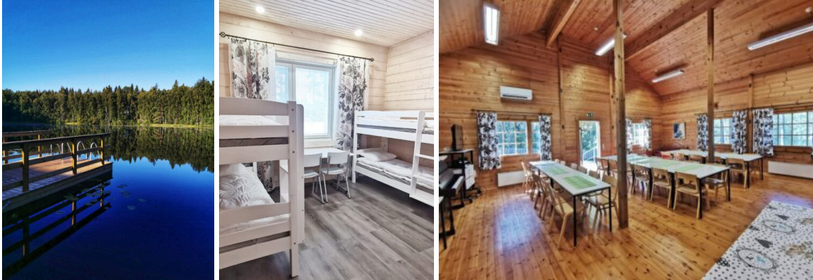
Accommodation 27.-29.7. Mustajärvi camping area.

Mustajärvi camping area until the morning of July 29th. During these days, participants will get a feel of the Finnish nature while experiencing sustainable living by exploring the forest, picking blueberries, playing beach volleyball and enjoying sauna and swimming in the lake. Please remember to bring your swimming suit with you !