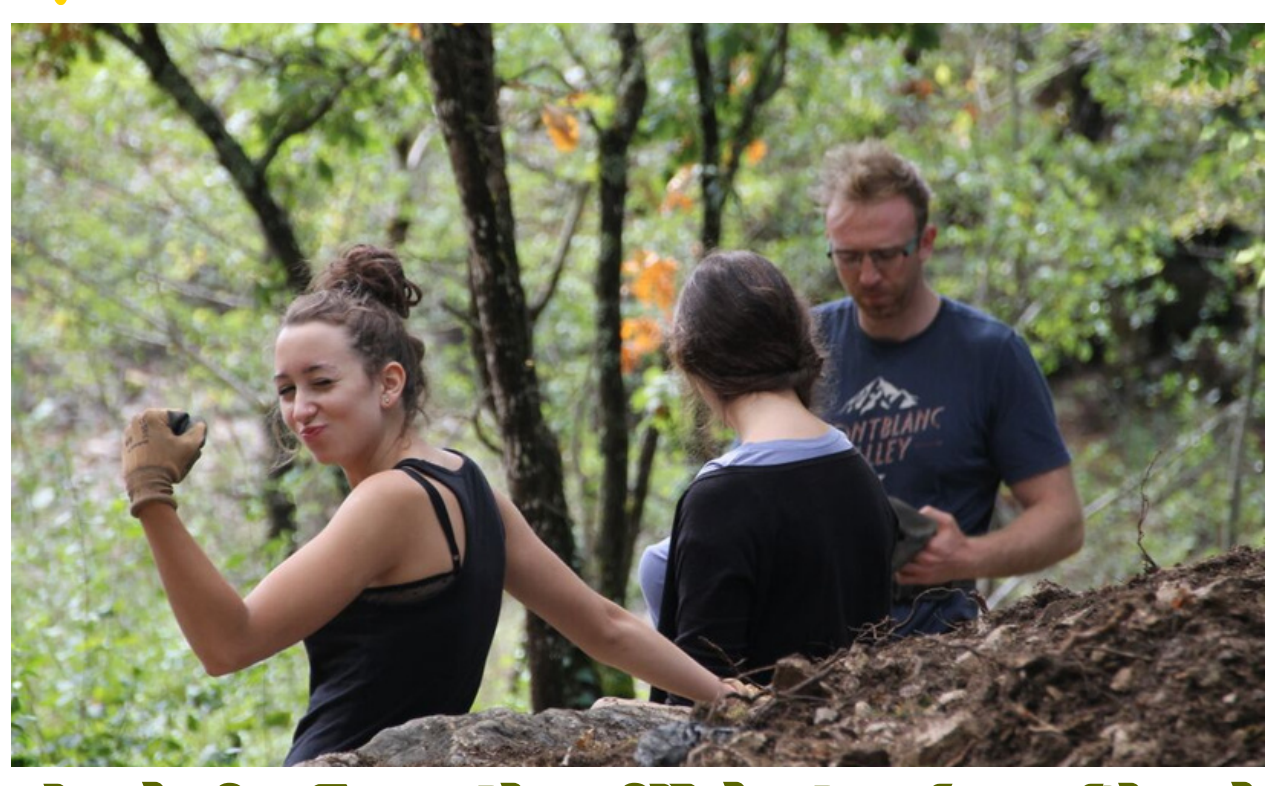
Apply for 7 months of Volunteering with usl From April to October.