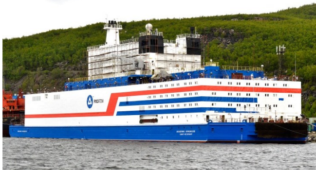
The newly-painted Akademik Lomonosov in Murmansk

Russia's Rosenergoatom has received an operating licence for its floating nuclear power plant, Akademik Lomonosov , from the country's regulator Rostechnadzor. The facility is 144 metres in length, 30 metres wide and has a displacement of 21,000 tonnes. It has two 35 MWe KLT-40S reactors.